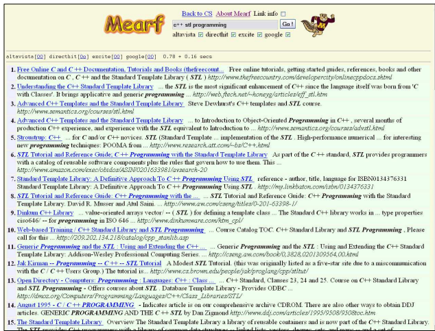
Figure 2: Mearf results for the query “C++ stl programming”

all in a single, compact, ordered list fitting about 20 results on a typical browser page.